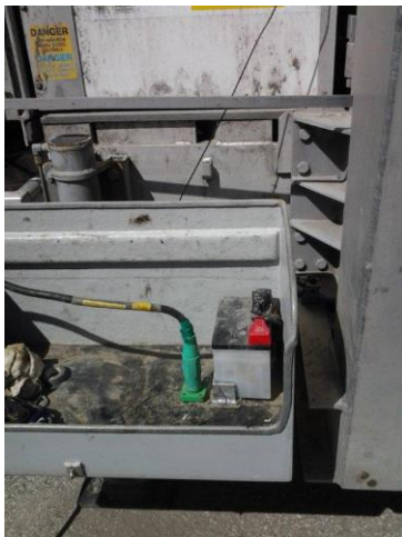
Mobile Stage frame bonded

Examples of metal surfaces to be bonded: